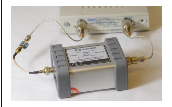
2-Port Shunt-Through test setup using the Copper Mountain S5065 and the J2102B-BNC