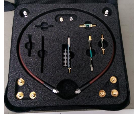
PCK01 High Performance Cable and Connector Kit

Picotest provides products that are designed to simplify measurements while providing the ultimate resolution and fidelity.