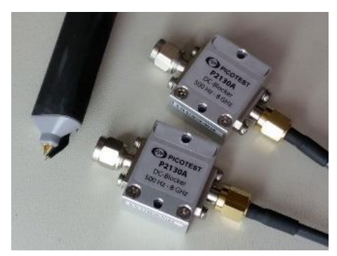
P21B01 PDN Probe Bundle and DC Blocks (2-Port Probe shown)