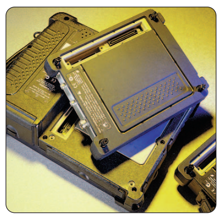
Y350C platform combined with test modules.

The Tektronix NetTek Y350C platform includes the display, power supply, CPU and battery compartments. Measurement modules can then be attached to the back. Up to four modules can be attached at once. A variety of modules and options allows you to tailor the instrument to service the standards and interfaces in use in your network.