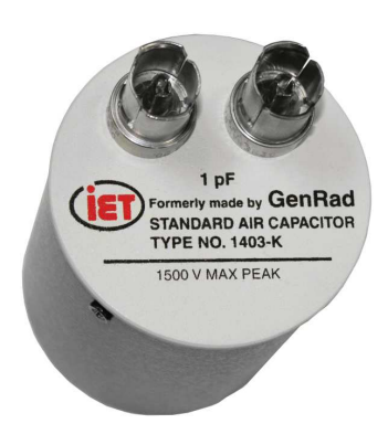
Model 1403 1 pF Standard Capacitor