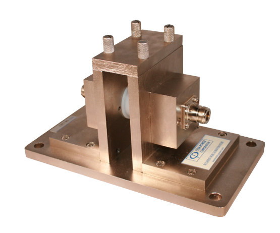
FCLCE-438 Calibration Fixture

All values are typical values unless otherwise specified. Specifications are subject to change without notice.