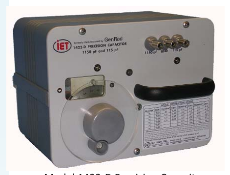
Model 1422-D Precision Capacitor

The 1422 is a stable and precise variable air capacitor intended for use as a continuously adjustable standard of capacitance. One of the most important applications is an AC bridge measurements, either as a built-in standard for substitution measurements. It is available in a variety of ranges, terminal configurations, and scale arrangements to permit selection of precisely the required characteristics.