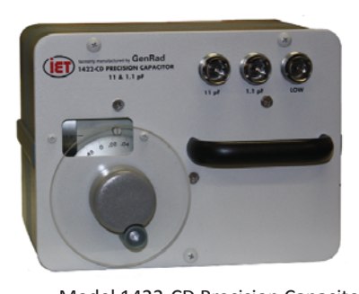
Model 1422-CD Precision Capacitor

Two-terminal - The 1422-D is a dualrange 115 pF and 1150 pF, two-terminal capacitor, direct reading in total capacitance at either range terminal to ground.