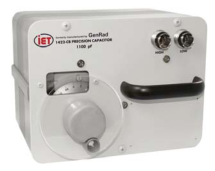
Model 1422-CB/CL/CC Precision Capacitor